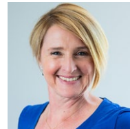
Zoë Routh Leadership Expert