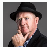
Steuart Snooks Productivity Authority